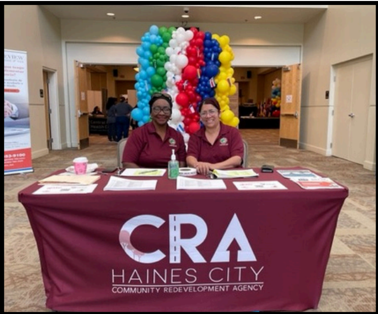
Latin Business Expo

An engaged community is a strong community. Throughout the year there have been many community engagement opportunities. From learning financial wellness to giving feedback for a master plan, the CRA has thrived through informed citizens.