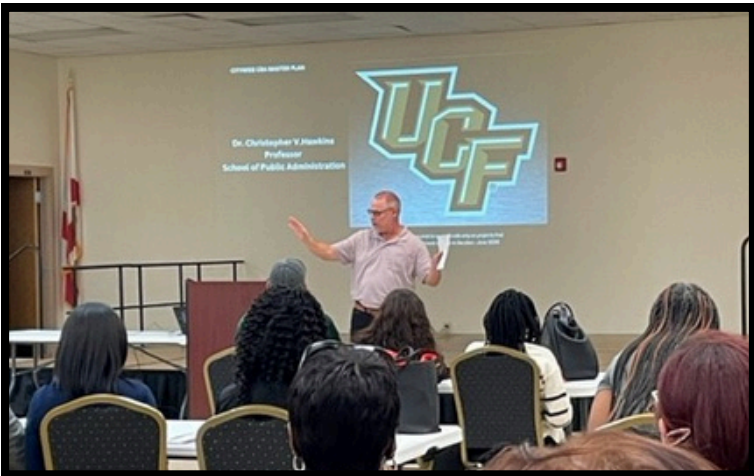
UCF Master Plan - Community Meeting