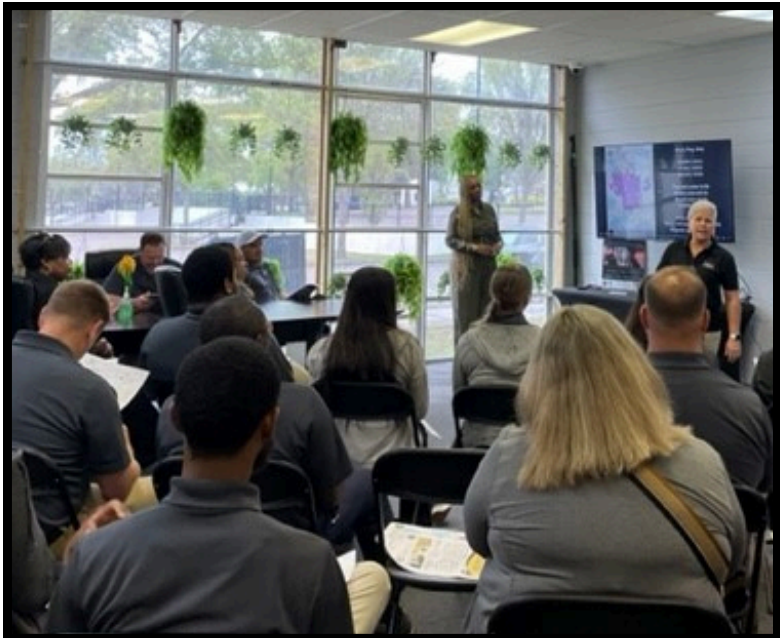
Northeast Polk Chamber Leadership Class